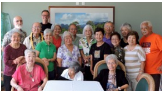
Pohai Nani Fellowship