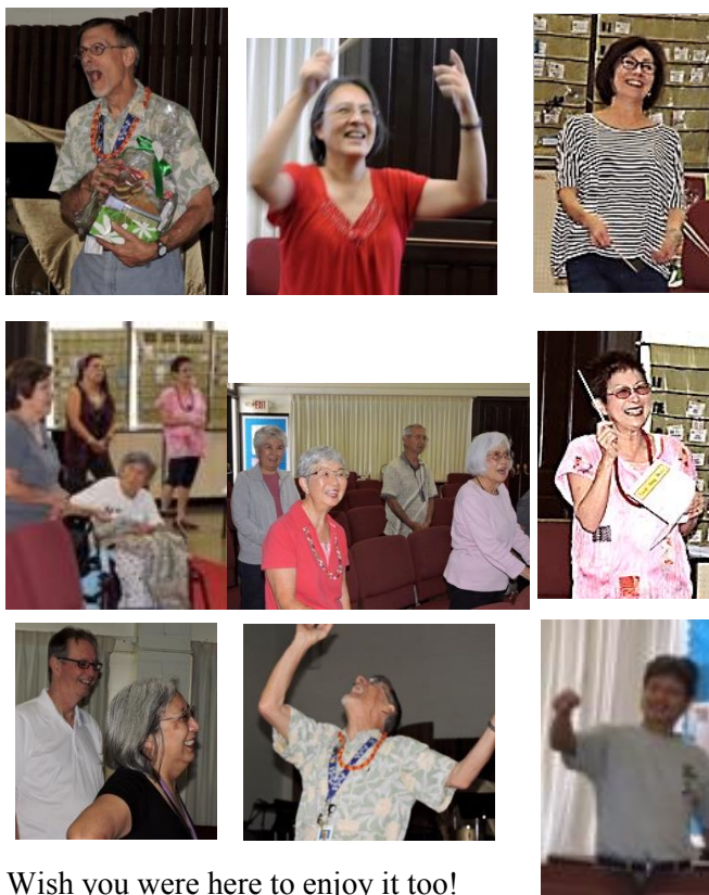
Wish you were here to enjoy it too!