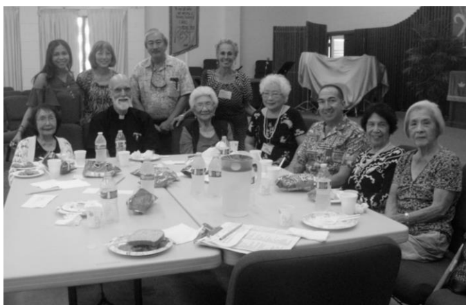
Gathering the diversely gifted children of God as “many yet one in Christ”.

HIM Conference 2017 – Mercy was a blessing for the almost 4000 participants that attended this year. Since its founding, Him has gathered believers from across denominations, generations and cultures around Jesus to be the Body of Christ. Him equips, embraces, emboldens, and encourages men, women, and youth toward Christian transformation, unity, and lives that make a difference now and for eternity. HIM nurtures unity amid diversity, trusting in God who is Greater than our hearts.