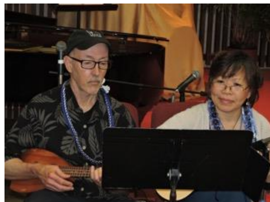
“Giving Thanks for your gift of music”