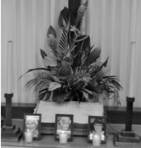
All Saints Day