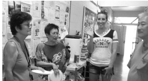
Filipino UCC Worship Team