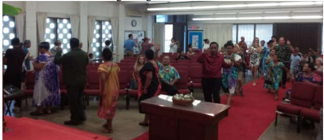
We offered our gifts in fellowship and unity.