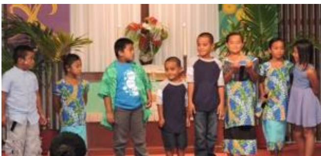
The Chuukese children shared a special song for all of us!