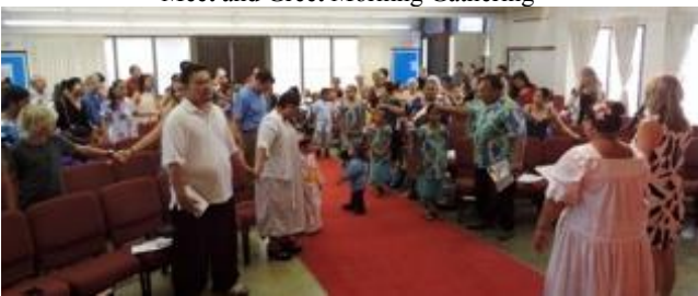
Kailua Christian Church & the Chuukese Congregational Church of Christ together in Worship on Oct. 22 –