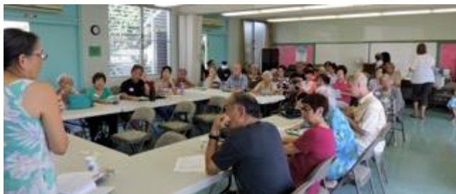
Meet and Greet Morning Gathering