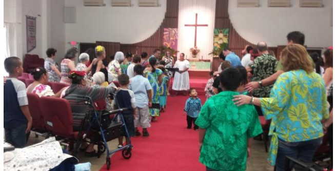
A blessing was given on the children