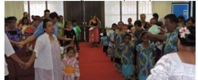
Praising God together!