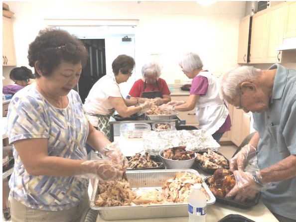
KCC (River of Life) Kitchen crew too busy to stop and take a group picture. (Humility 101)