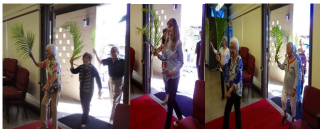
Palm Sunday Procession