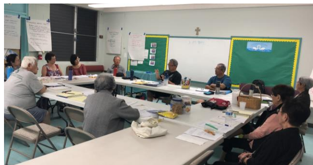
Leadership Retreat in March. 16 Leaders participated from Council, Deacons and Trustees.