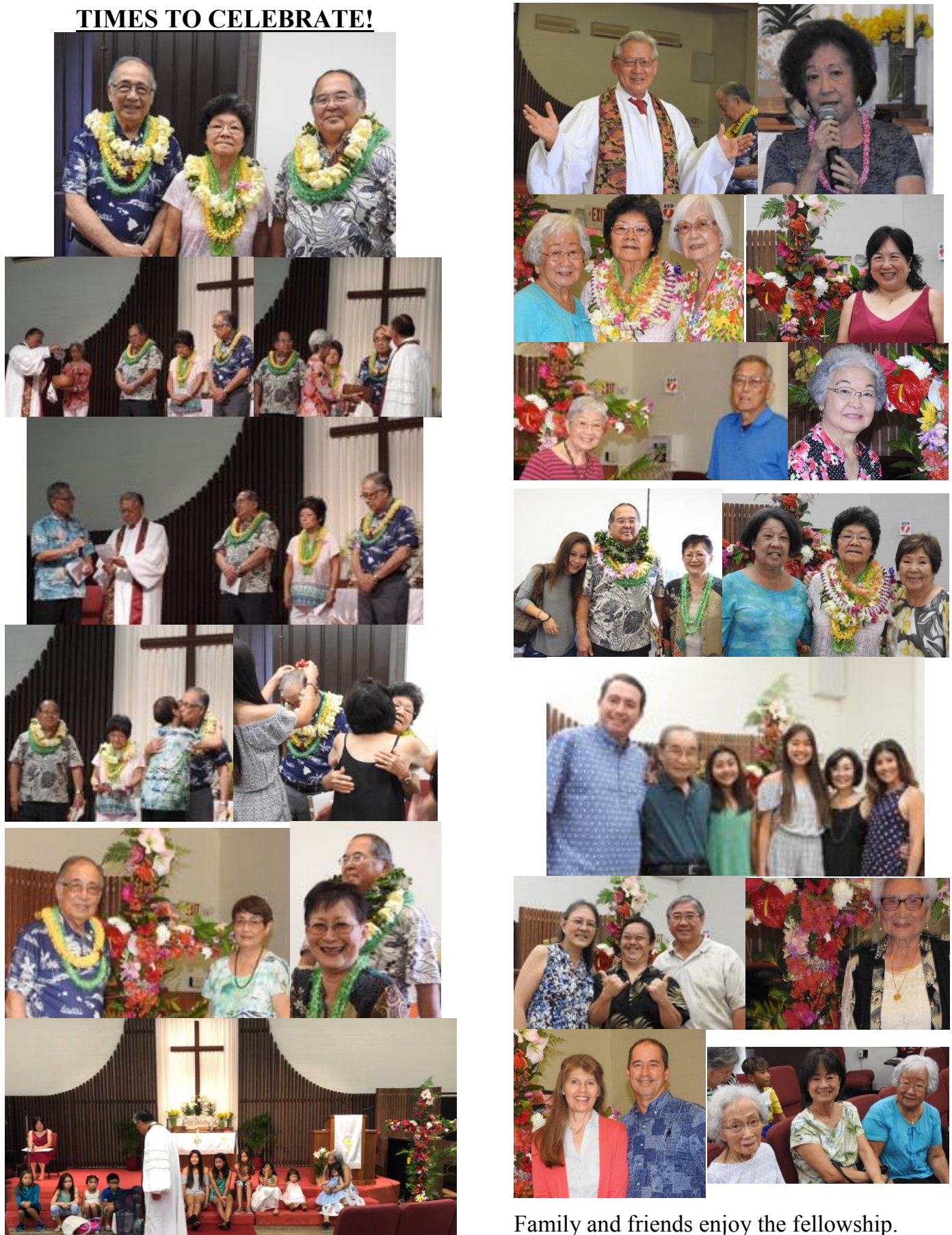
Family and friends enjoy the fellowship.