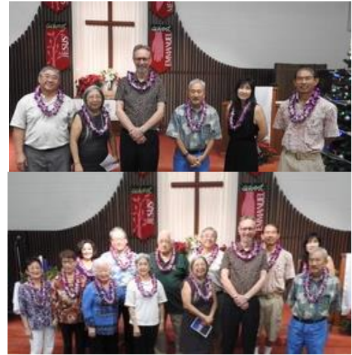
Your church leaders for 2020