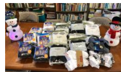
230 pairs of socks distributed for Christmas at River of Life - compliments of KCC.

~ in addition a donation to the Institute for Human Services (IHS) was given as they build on their wonderful programs that have helped families with housing and helped them to learn skills as they do gardening and try to give back. (Read their Newsletter with great hopeful stories.