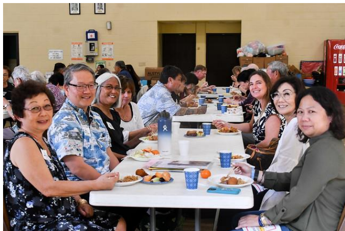
UCC Leadership Conference hosted at Nuuanu Congregational Church.