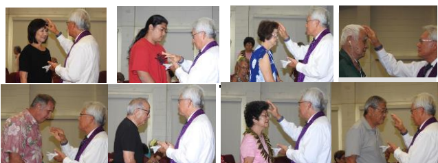
Wed. Feb. 26, 2020