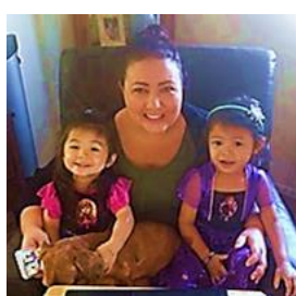
The Grable Girls