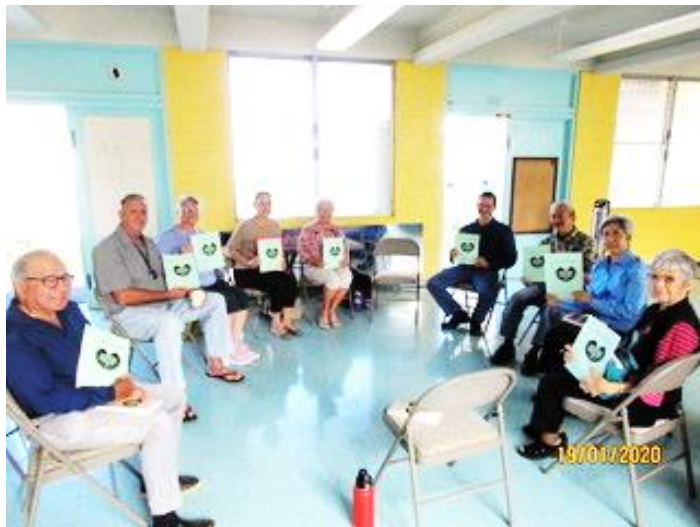
Bbile Study Class