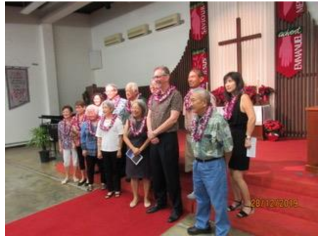
Installation of our Leaders Dec. 1999