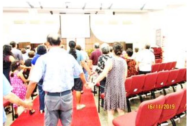
Singing You Are the Vine at the end of Worship