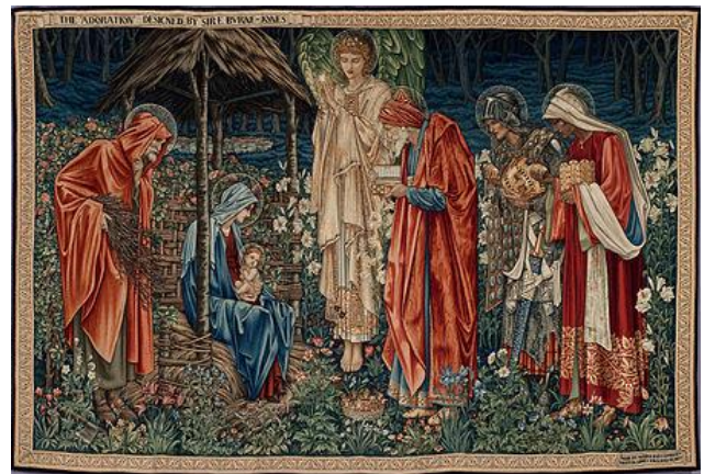
The Adoration of the Magi by Edward Burne-Jones (1904)

Epiphany is a season of worship, as the whole world follows the Wise Men to find and honor Jesus. The color of Epiphany is green.