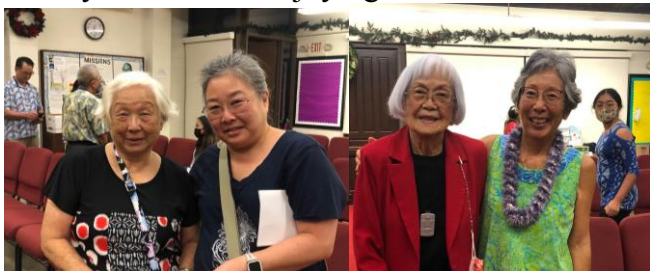
Gracious Pastors helping us in our time of need.