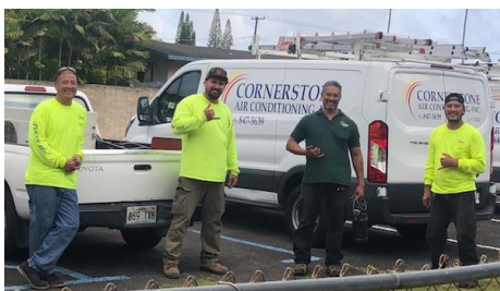
Thank You gift from East Shore Church