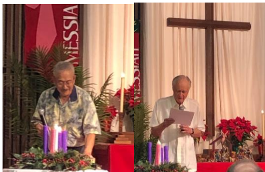
. Advent Candlelighting on Christmas Eve and readers sharing their stories