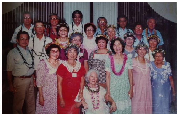
From Our 30 th Anniversary Celebration